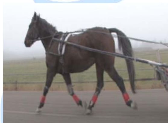
Trotter tested in action

17 th ETB-Pegasus attended BSJA training event with Equestrian Edge at Towerlands Park.