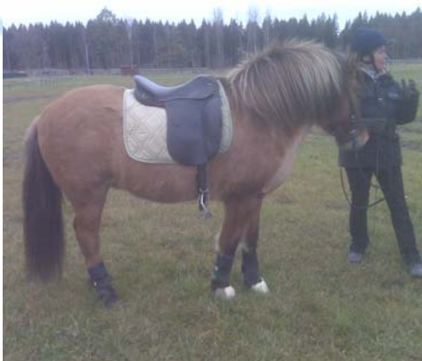
Icelandic pony ready for test

11-13 th ETB-Pegasus went to Sweden for trials on trotters and Icelandic horses with Lars Roepstorff.